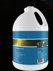
QDF Quick Dissipating Fluid

CHAUVET DJ has a variety of haze machines, fog machines and atmospheric effects with a full array of powerful production features to meet any event effect needs.