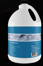
HDF High Density Fog Fluid