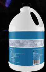
FJU High Performance Fog Fluid