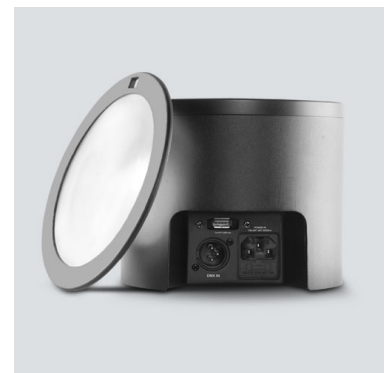
Robust and Sit-flat housing and Magnetic Fresnel lens allows you to go from ultra-wide to narrow beam