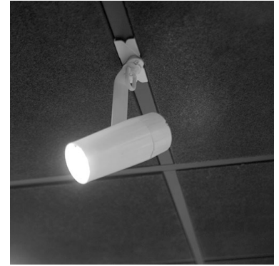
Clamp them to ceilings with the included scissor clip