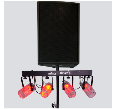
Safely mounts to 4BAR as well as most tripods and speaker stands